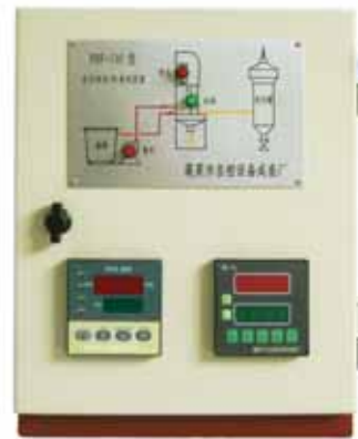
PHF-105型 PHF-105 Model